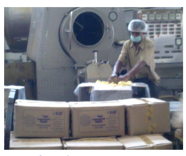
Industrial Visit – Understanding manufacturing process