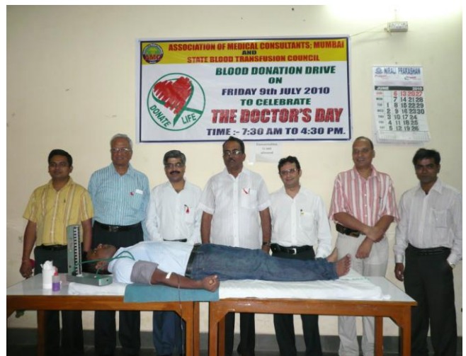
Blood Donation Drive