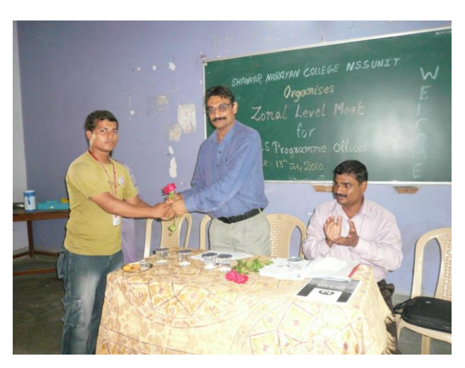
Zonal Level Meet

Activities conducted by NSS Unit – 2010-2011