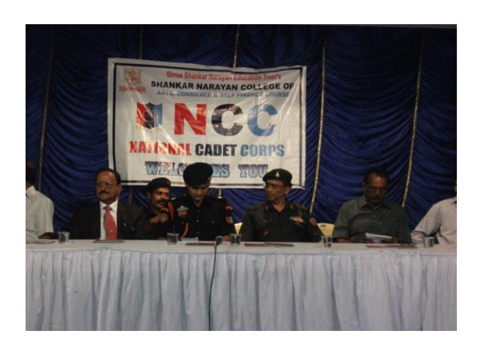
NCC Inaugural Function