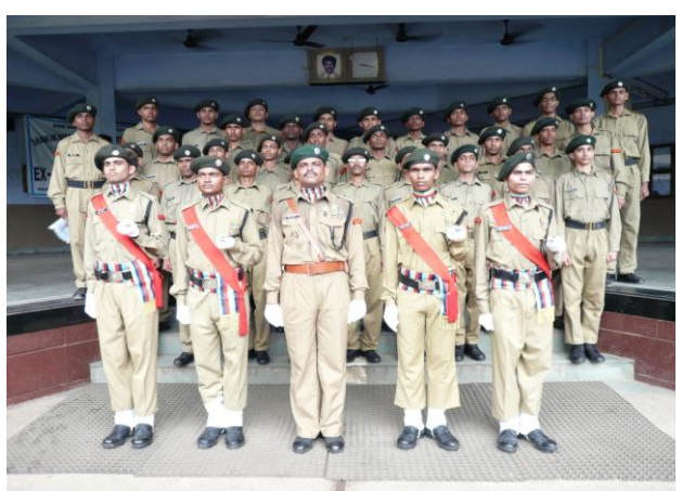
NCC Unit of the College