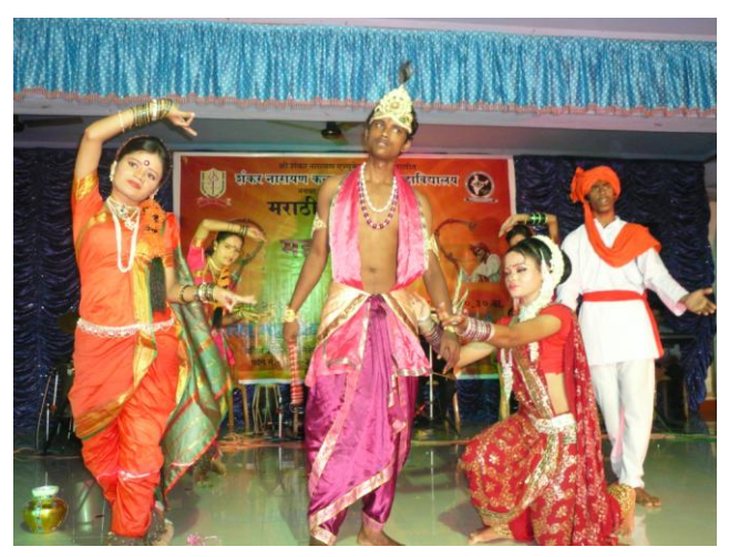
Maharashtra Darshan 2010 - Folk Dance