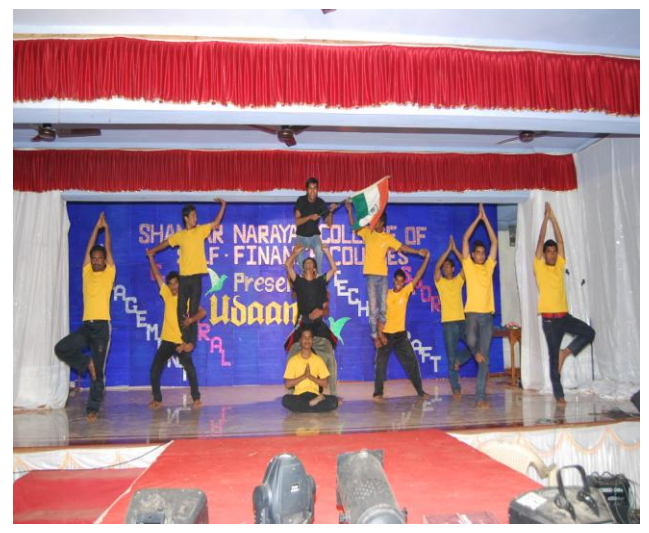
UDAAN – Cultural Events 2011