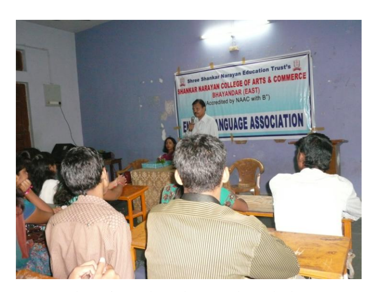
Inauguration of English Literary Association