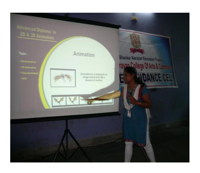
Information on Job profiles & career option