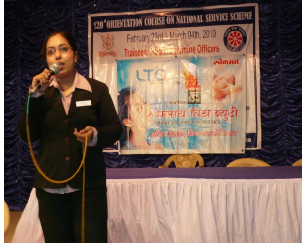
Personality Development Talk