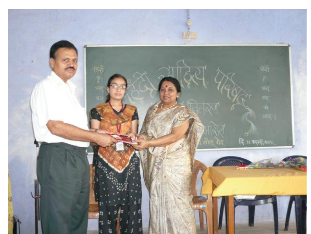
Hindi Sahitya Parishad - Inaugural Function