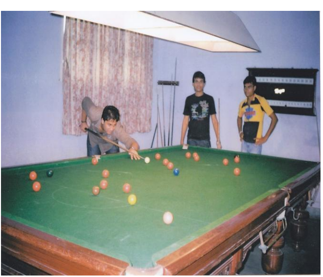
Annual Sports Week 2009-10

College Sports Week Events – Indoor-Outdoor Events