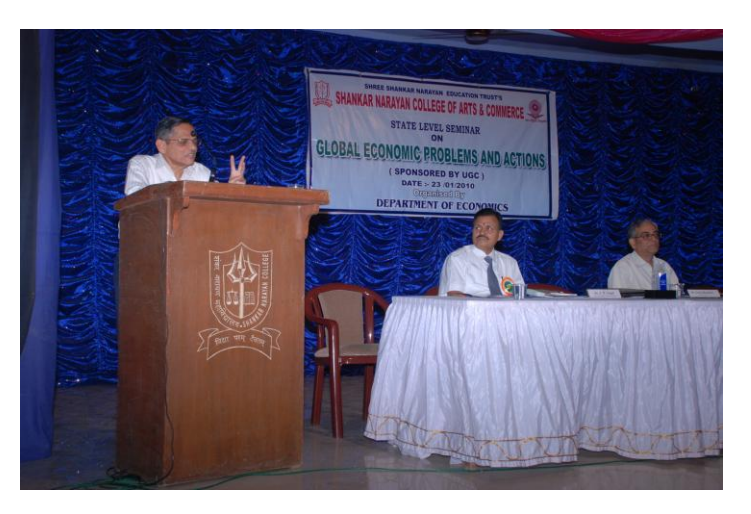
Talk on Global Economic Crisis

State Level Seminar on Global Economic Problems and Actions