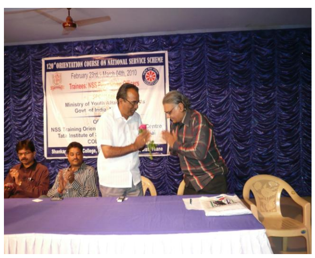
NSS 120<sup>th</sup> Orientation Programme