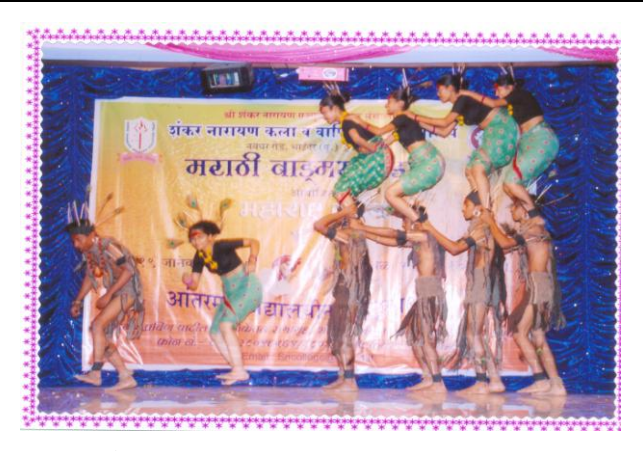
Maharashtra Darshan Intercollegiate Event