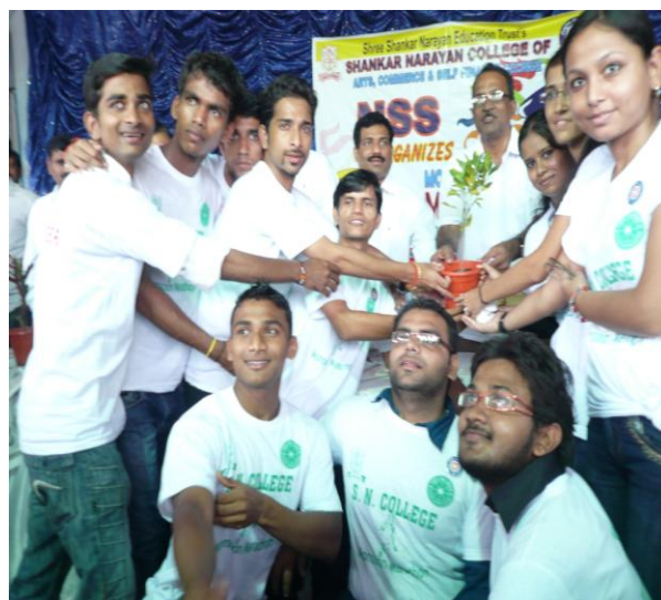
Mega Monsoon Marathon